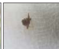
Wart removed from the canal