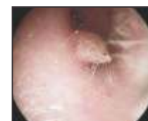
Wart in the external auditory canal