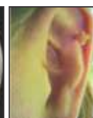
Wart on the lobule