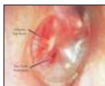
Small tympanic membrane perforation